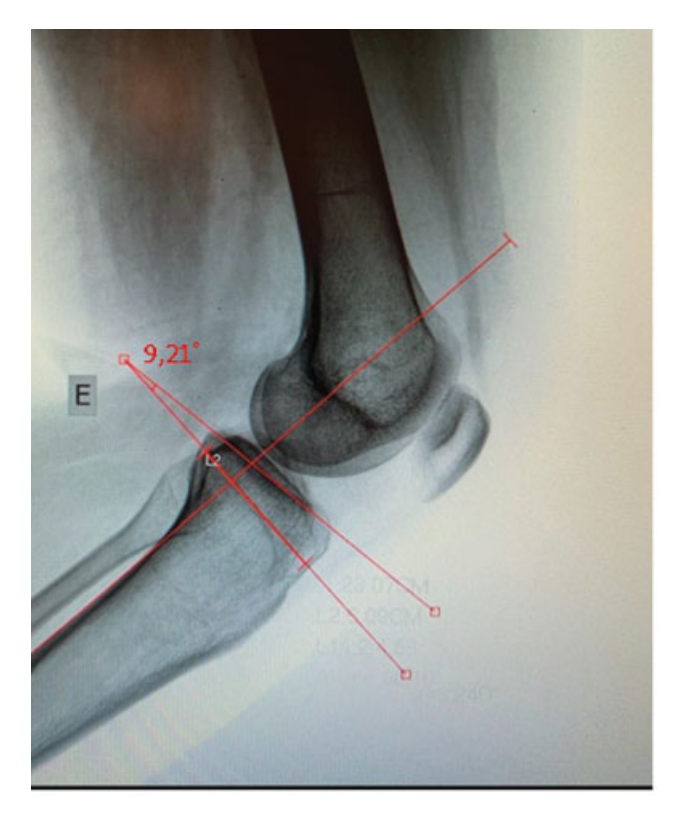
Fig. 1 Demonstration of measurement of posterior tibial inclination.

A Receiver Operating Characteristic (ROC) curve was built to identify the best cutoff point for posterior tibial slope for