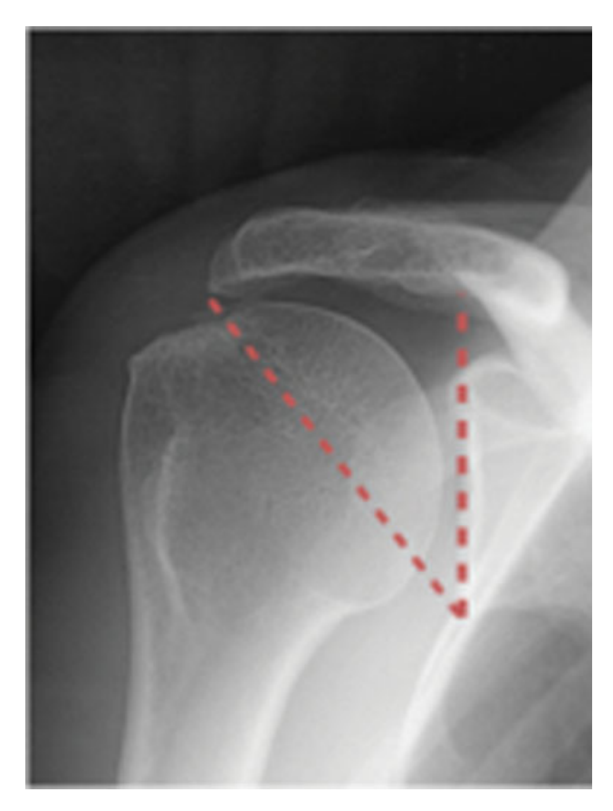
Fig. 3 Critical shoulder angle.

glenohumeral arthrosis in CSA < 30°. This fact has been demonstrated by other authors. ^{23}