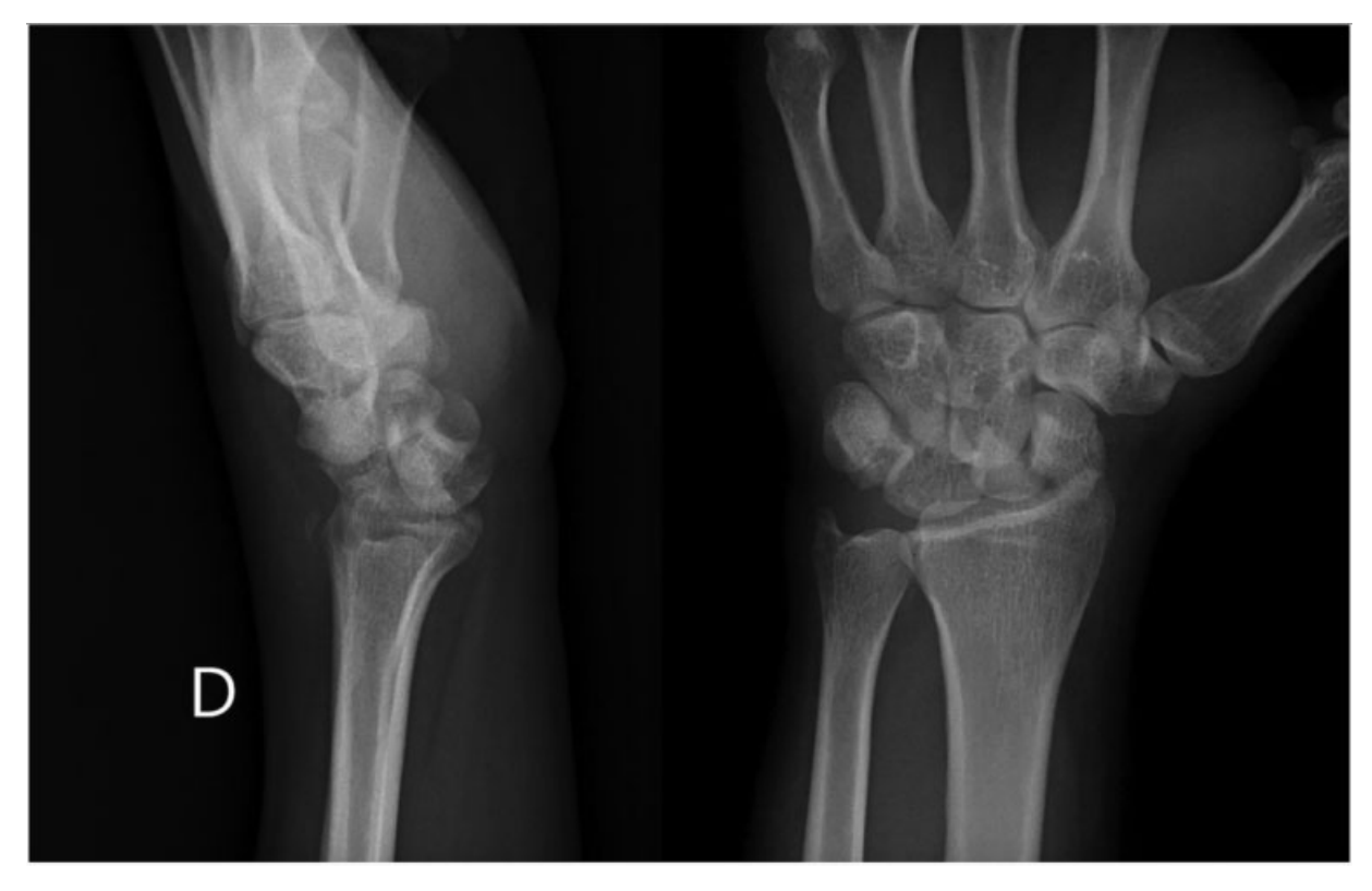
Fig. 3 Trans-scaphoid lunate fracture-dislocation, Mayfield stage III.