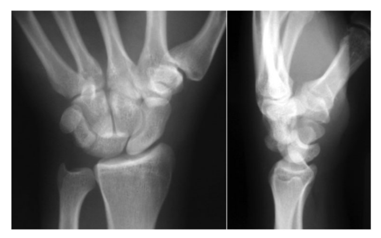
Fig. 1 Perilunate dislocation, Mayfield stage III.

There were no relevant differences between trained orthopedists with SBOT, accreditated or not. As for the