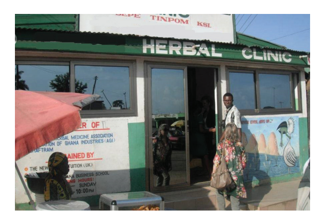
Figure 2 - A herbal clinic in Sepe Tinpom, Kumasi, Ghana.