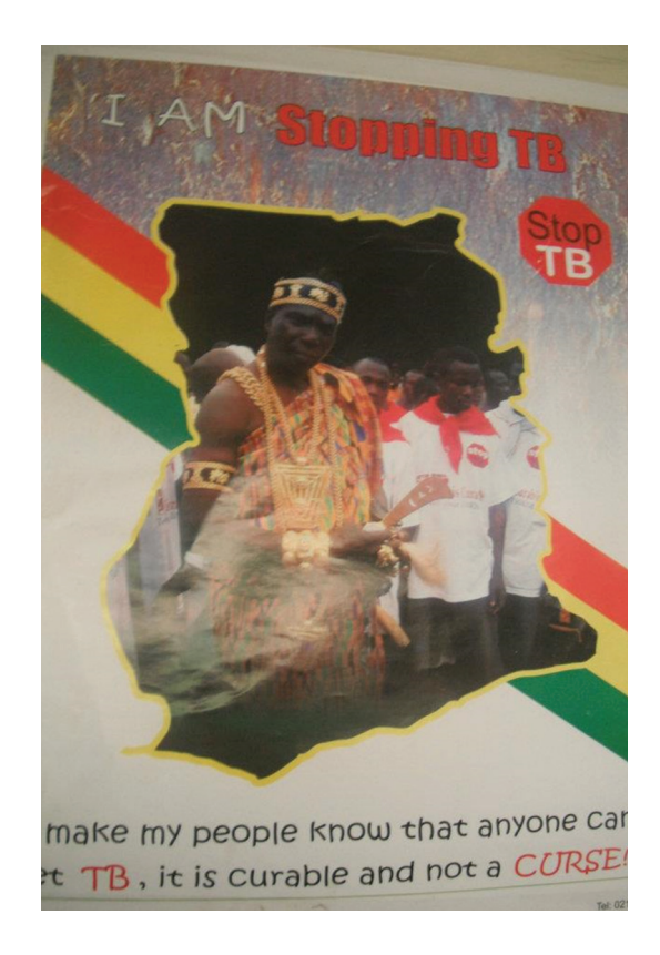
Figure 4 - Poster of a tribal chief motivating people to communicate TB (fixed in the Komfo Anokye teaching hospital, Kumasi, Ghana).

It can be seen, therefore, that there are efforts to organize a healthcare service for TB and other prevalent diseases that impact the health of the population, and that in general, the model adopted follows the international guidelines (Fig. 4). However, without economic, geographical, cultural and organizational conditions that are consistent with the models developed in and for other regions of the world, there is a delay, and significant limitations in health programs for dealing effectively with communicable diseases, which compromise their results. What is noticeable is the clear separation between the official healthcare system and the therapists (especially the traditional healers, but also to the new herbalists and therapists with some formal education), and the health programs are failing to capitalize, in a systematic way, on the influence, proximity and legitimacy of these professionals, especially those practicing in more remote regions, as support