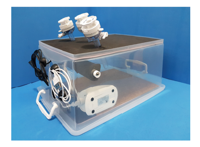
Figure 4 - Simulator final aspect: camera attached to the camera holder with cable tie. Flexible table lamp passed behind the camera holder with the LEDs pointing toward the center of the simulator.

Three trocars were installed through linear cuts with scalpel blade, in the EVA sheets, in the topography of each of the holes of the box, to facilitate the entry of the trocars. Four rubber organizers were glued on the outside of the smaller face of the box to organize the camera and luminaire wires. The final appearance is shown in Figure 4.