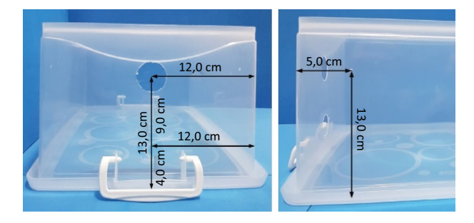
Figure 2 - Holes made in one of the small sides of the box to pass the wires of the camera and the luminaire. 3 mm holes made in each of the bigger sides of the simulator to fix the camera holder.

Figure 1 - Location of the trocars' holes at the bottom of the simulator. Position of the corkboard on the lid and camera holder appearance.