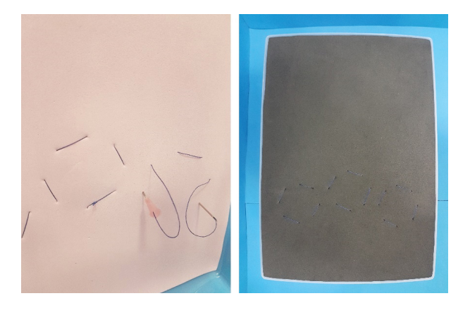
Figure 3 - Layers of EVA fixed with 2-0 cotton threads, by a 40.0 \times 1.2 \text{ mm} (18 \text{ G} \times 1 \text{ 1/2}'') needle. Fixation through the 3 mm holes made around of the 32 mm holes at the bottom of the simulator.

The box itself was used to demarcate the shape and size of the pieces of the original sheet. The first (outer) must be glued in isolation from the others to allow the fixation through the 3 mm holes, using 2-0 cotton threads, by a 40.0 \times 1.2 \text{ mm} (18 G x 1 1/2") needle (Fig. 3). The other two can be glued simultaneously and fixed in the same way. Another sheet of EVA was glued onto the outside of the box, with aesthetic purpose.