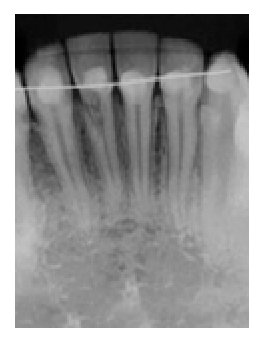
Figure 1. Periapical radiography showing an irregular but well-limited radiolucency at the cementoenamel junction of the mandibular right central incisor.

rvealed an irregular yet well-limited radiolucency at the cementoenamel junction of the right mandibular central incisor (Fig. 1). Her medical history was unremarkable, but she had a history of orthodontic treatment. There was no