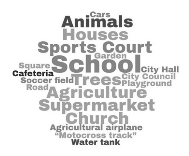
Figure 4 - Word cloud of protective(left) and destructive (right) elements to life in rural and urban schools in the municipalities of Campo Novo do Parecis, Sapezal and Campos de Júlio