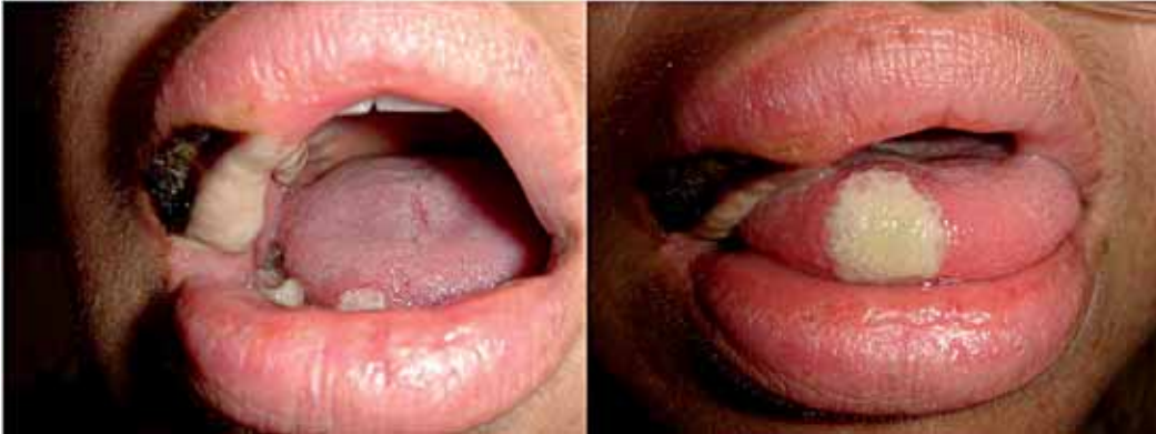
FIGURE 1: Deep and painful oral ulcers, partially necrotic and quite disfiguring

mTOR inhibitor-associated stomatitis is a newly recognized and frequent drug-related complication. It is a significant toxicity that leads to dose modifications, treatment delay and interruption of antineoplastic and immunosuppressive regimens. 2,4,5 Lesions are usually described as painful, long-lasting oval ulcerations that resemble aphthous or herpetic stomatitis. 3,4,6 Although its mechanisms remain unknown, it seems that the frequency, duration and severity of this