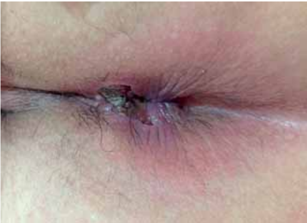
FIGURE 2: Deep, perianal ulcer, involving the skin and semi-mucous surface

side effect are associated with high doses and blood levels of everolimus. 2,3,6,7 Empiric treatments, such as sodium bicarbonate-based mouthwash and oral fluconazole, appear to be useless and managing the condition remains challenging. 3