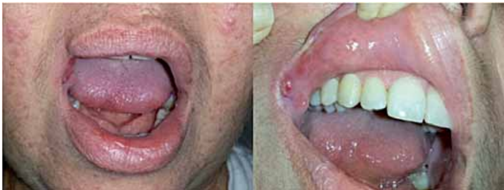
FIGURE 4: Complete reepithelization 40 days after everolimus discontinuation. Residual deformity in the superior lip, with aesthetic and functional impairment

Blood levels above target that were detected in this patient could be attributed to drug interaction, probably with the protease inhibitors, atazanavir and ritonavir, which are potent inhibitors of the cytochrome P450 enzymes. 9,10