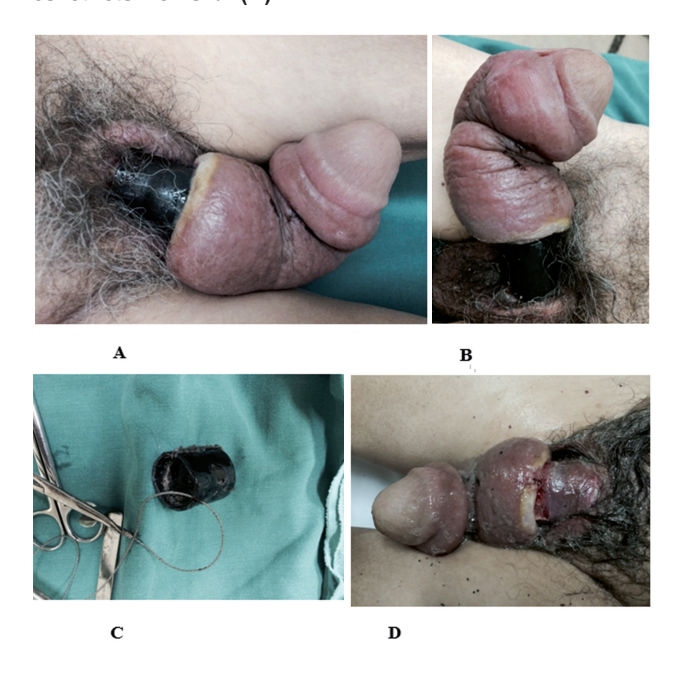
Figure 4 - Patient with penile incarceration produced by metallic ring. Metallic ring removal through orthopedic cutting plier (A). Final appearance of the penile shaft after penile constrictor removal (B).

Figure 3 - Patient with penile incarceration produced by plastic tube (A+B). Gigli saw used to remove the foreign body (C). Final appearance of the penile shaft after penile constrictor removal (D).