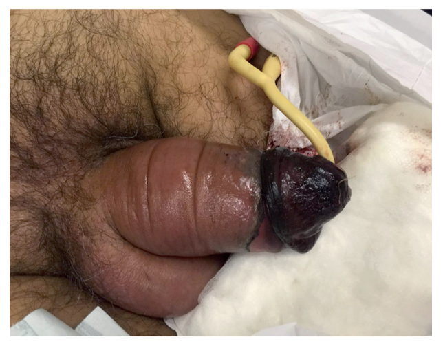
Figure 2 - Patient with penile incarceration produced by a plastic ring with signs of tissue impairment of the distal penile shaft.

There are many reports of different devices that have been used as well as techniques and suggestions for their removal (13, 14). The approach of choice depends on the type of the constricting