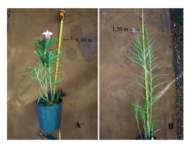
Figure 3. Arundina plants treated with (A) 5 mg L^{-1} paclobutrazol at 0,50 m height and (B) 6000 mg L^{-1} CCC at 1,50 m height.

Significant differences were observed in the plant height among the treatments (Table 1). At the beginning of the experiment, all of the plants were approximately 40 cm tall. The first height assessment was performed at four months after the beginning of the experiment when the first responses to the PGR treatments were visible. Similar responses were obtained within the same timeline by Hagiladi and Watad (1992) using Cordyline. A clear difference between the treated and untreated plant responses was observed at 120 days after transplanting the seedlings. This result suggests that the effect of paclobutrazol as a gibberellin biosynthesis inhibitor operates at the levels of leaf cell elongation, dry matter production, shoot plant elongation and other characteristics (STEFANINI et al., 2002).