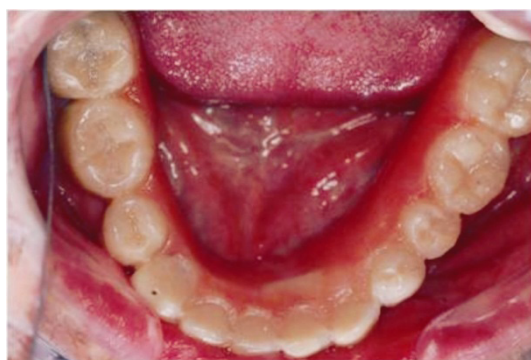
Figure 5. Overlay RPD in the patient.

The patient returned for installation and occlusal adjustments of the overlay RPD (Figure 5); and the prosthesis was approved by him (Figure 6).