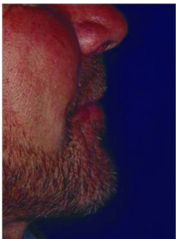
Figure 3. Profile of the patient after restoration of VDO.

After determining the RC position, an interocclusal record was made using heavy condensation silicone (Profile, Vigodent, Rio de Janeiro, Brazil), between the superior complete denture and the lower teeth, based on the determined value for the VDO (Figure 3). The casts were mounted in a semi-adjustable articulator (SAA) using the obtained record. The incisal guide pin was placed and kept at zero; the articulator was placed upside-down; the set of base plate and interocclusal record in silicone was inserted on the lower cast and these were embedded in the antagonist cast (duplicated complete denture) that was already mounted in SAA from taking the face-bow. Stone type IV (Durone, Dentsply, Rio de Janeiro, Brazil) was manipulated and poured on the basis of the lower cast. The lower member of the articulator was placed in position until it was touched by the incisal pin. Initially, a pillar with stone type IV was made, the setting was awaited, and then the mounting was completed using model plaster for filling 11 . The articulator was sent to the laboratory for waxing (Figure 4) and processing the overlay prosthesis, recovering the lost VDO of the patient.