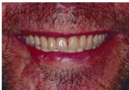
Figure 6. Final smile of the patient.

After six months of adaptation to the new VDO, the patient will be rehabilitated with a new upper complete denture with a metal occlusal surface and metal ceramic crowns with metal occlusal surfaces using intracanal retention with cast metal post in the lower arch. The patient will be sent to the Temporomandibular Clinic at the State University of Ponta Grossa, and an occlusal splint will be installed on the lower arch as supportive