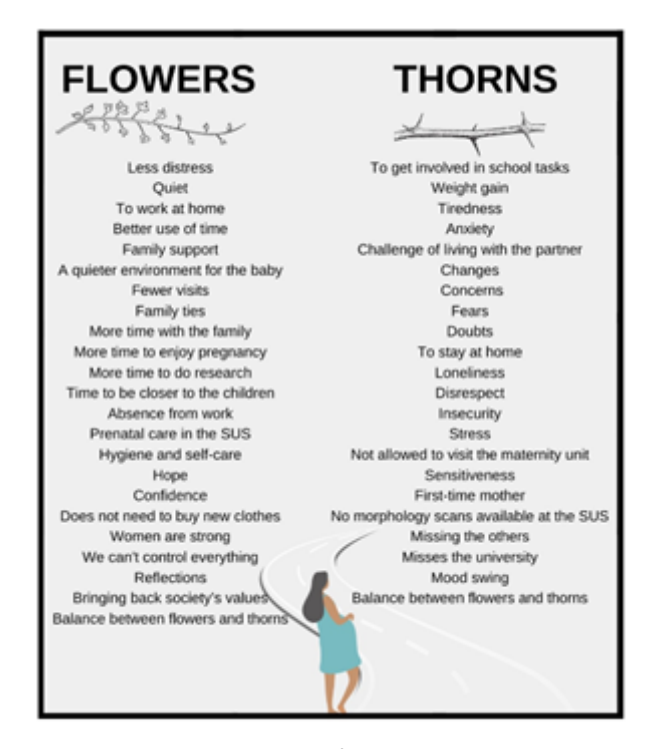
Figure 2 – Representation of encodings and generating themes unveiled in the Virtual Culture Circle Source: Elaborated by the authors based on the VCC dialogues, 2020.

Source: Elaborated and adapted by the authors from the concepts proposed by the authors (7).