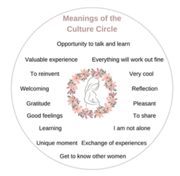
Figure 3 – Meanings of pregnant women in experiencing the Virtual Culture Circle

Asked about the meanings of participating in the VCC, the pregnant women said it was a special moment of sharing experiences, which provided learning, welcoming, dialogue, pleasure and good feelings, as seen in Figure 3.