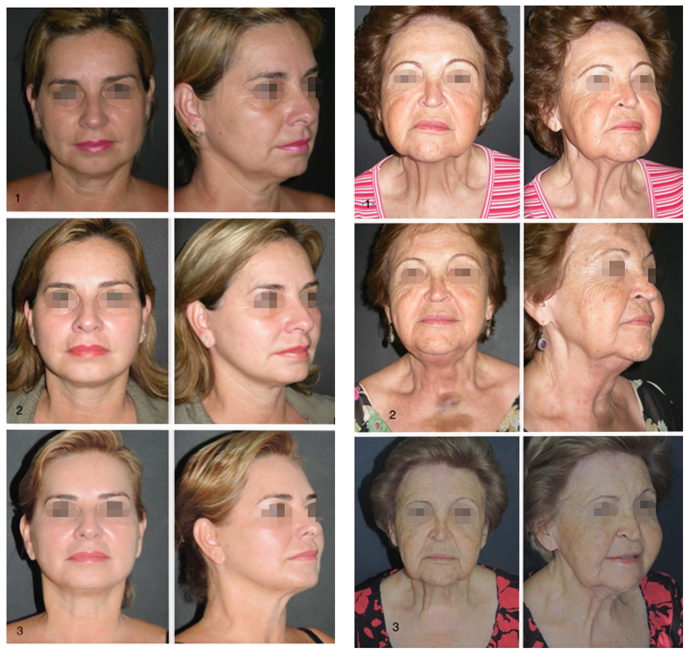
Figure 3. Satisfactory result. 1. Preoperative. 2. Postoperative period of 1 year. 3. Postoperative period of 7 years.