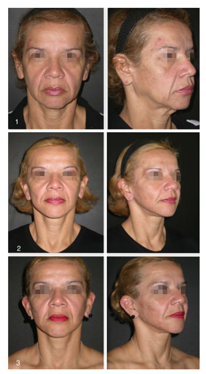
Figure 2. Excellent results. 1. Preoperative. 2. Postoperative period of 1 year. 3. Postoperative period of 7 years.

The history of treatment of the cervical region shows us the contribution of various pioneering authors in refinements of the skin, platysma, SMAS, and adipose tissue. Millard et al. 11 in 1968, with the cervical lipectomy; Guerrero-Santos² in 1974, with muscular flaps traction toward the mastoid; Peterson¹² in 1978, with sections and lateral tractions of the platysmal muscle; Aston and Kaye⁴,⁵ in 1981, with medial and lateral sections of the platysma muscle; Connell³ in 1983, with the total sectioning of the platysma muscle;