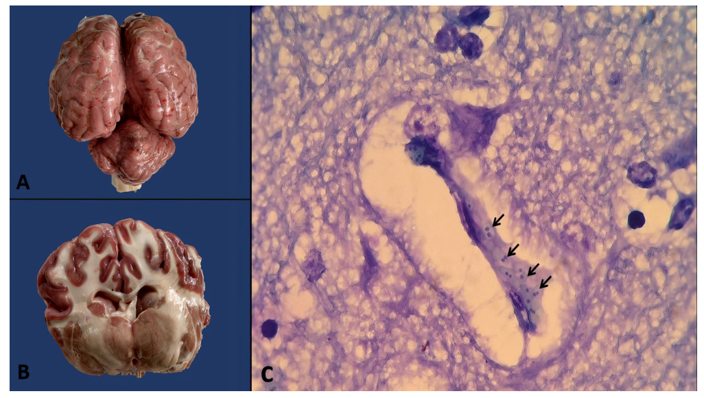
Figure 2. (a) Encephalic surface showing cherry-pink color; (b) Telencephalon sections showing cherry-pink color in the cortex; (c) Telencephalon: capillary in the cortex filled with red blood cells containing intra-erythrocyte structures compatible with Babesia bovis . Toluidine Blue staining,100X.