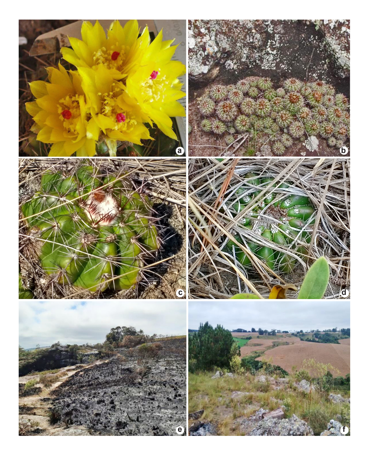
Figure 1 – a-f. Characteristics of Parodia carambeiensis , Campos Gerais, PR (Brazil). – a. flowers; b. lanugo as an indication of maturity; c. a local subpopulation; d. influence of Pinus spp; e. occurrence of recent wildfire in one study site; f. agriculture.