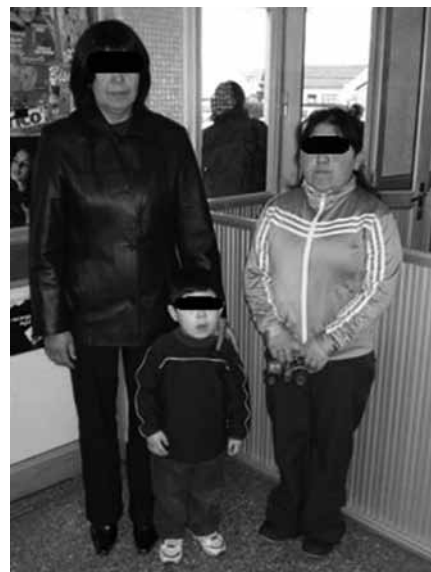
Figure 1. Patient at 3.3 years of age, his mother and his unaffected grandmother.

The study protocol was approved by the ethics committee, and the informed consent was obtained from the parents. After obtaining written informed consent for the study, peripheral blood leukocytes genomic DNA was extracted from the patient and his mother. Ten intronic primer pairs were used to amplify exons 1-13 from the GNAS gene. After amplification confirmation by electrophoresis in agarosis gel, PCR products were submitted to automatic sequencing reaction. The results were compared to the wild type GNAS sequence published at www.ensembl.org (ENST00000371085).