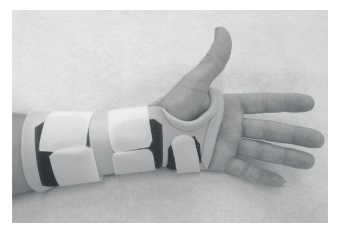
Figure 2. A custom-made splint manufactured with thermoplastic material.