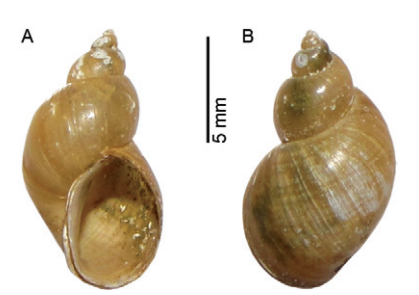
Fig. 1: specimen of Lymnaea diaphana collected at its type locality of Cape Gregory, Strait of Magellan, province of Magallanes. Chile. A: ventral view; B: dorsal view.

A combined set of nuclear rDNA and mtDNA markers were polymerase chain reaction (PCR) amplified independently for each lymnaeid specimen and each PCR product was sequenced for a bona-fide haplotype characterization. The complete 18S rRNA gene was amplified using specific primers (Bargues et al. 1997, 2011a). The rDNA spacers ITS-2 and ITS-1 were amplified using primers designed in conserved positions of 5.8S and 28S rRNA genes and 18S and 5.8S rRNA genes, respectively (Bargues et al. 2001, 2006, 2007). The target 16S gene region was amplified using a set of universal primers (Simon et al. 1991). Amplification procedures and thermal cycler conditions were carried out as previously described for lymnaeids (Remigio & Blair 1997a). A cox1 gene fragment was amplified using other universal primers (Folmer et al. 1994). Amplifications were generated in a Mastercycle ep gradient (Eppendorf, Hamburg, Germany) using specific PCR conditions for each marker, as previously described (Bargues et al. 2011a). Ten microlitres of each PCR product were checked by