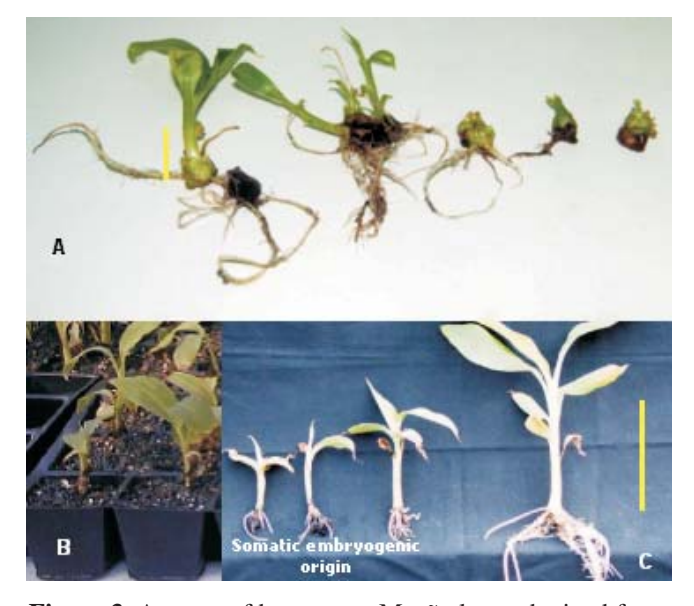
Figure 3. Aspects of banana cv. Maçã plants obtained from somatic embryogenesis. A: rooted plants regenerated from cell suspension with one month (yellow bar = 1.5 cm); B: acclimatized plants regenerated from cell suspension with size differences; C: acclimatized plants regenerated from cell suspension and from shoot tips with the same age (yellow bar = 10 cm).

<sup>(1)</sup>Experiment I used a recent developed cell suspension; experiment II used a six months older cell suspension culture; experiment III used a bombarded cell suspension.