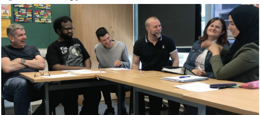
Figure 5 – Discussing phrasal verbs

There was some literal transference from the separate words which did not express the idea clearly but also some successful translations of the real meaning. Some learners had more exposure to certain phrasal verbs such as "give up" or "stand up" and this was easily conveyed in BSL. Others such as "iron out" and "die down" proved more problematic. The learners attempted to translate these into BSL and the process constitutes chaining and translation as well as simultaneous use of BSL and English in two different modalities.