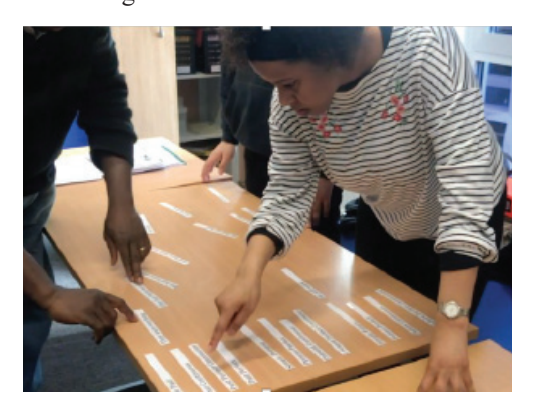
Figure 6 – Tense matching exercise

Chaining and translation are integral features of meaning-making allowing us to clarify and truly understand the target language. In the activity teaching the Past Perfect, there is some discussion surrounding the metalanguage and other vocabulary. Referring to the infographics and English text on the monitor I introduce the topic of the "Present Perfect". I need them to know the metalanguage in English as they will be seeing it and using it with their handouts and workbooks. I did not sign "perfect" using the established sign in BSL as per its other meaning (excellent/flawless). I needed to use a different sign, but there is no established<sup>5</sup> sign in BSL for "perfect" in the context of English grammar.