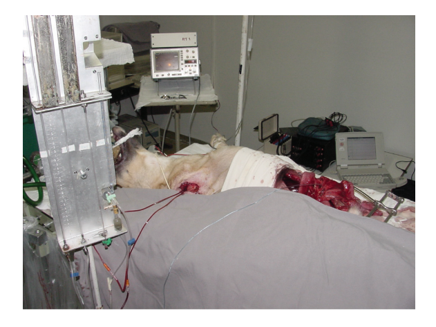
FIGURE 3 - Image of the animal underwent laparotomy with hemodynamic monitoring and evaluation of intestinal motility

Before the actual operation, the following procedures were performed: continuous monitoring of HR and rhythm through electrodes on the skin and dissection of the brachial artery and vein to measure, respectively, in MAP and CVP. Then, laparotomy was performed for implementation of the following: dissection of the vein and jejunal electrode fixation in jejunum biopsies of the bowel wall and partial occlusion of the portal vein during the pre and during occlusion. Aiming to assess the PP, the dissection of the jejunal vein was close to the cranial mesenteric vein and the duodenojejunal angle (Figure 3).