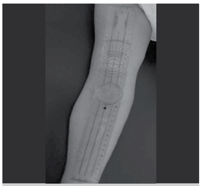
Figure 1. Representation of the measurement of the right elbow carrying angle by the clinical method.

When the individual was seen by the physician the radiographic examination of the affected elbow was required. We also performed the contralateral radiographic examination of the upper limb for comparison, since the physes and ossification nuclei could be confused with physiary fractures or lesions, a practice supported by orthopedic literature. The elbows were positioned in extension, with forearm supination in the anterior posterior view, on 30cmx40cm chassis film. The radiographic