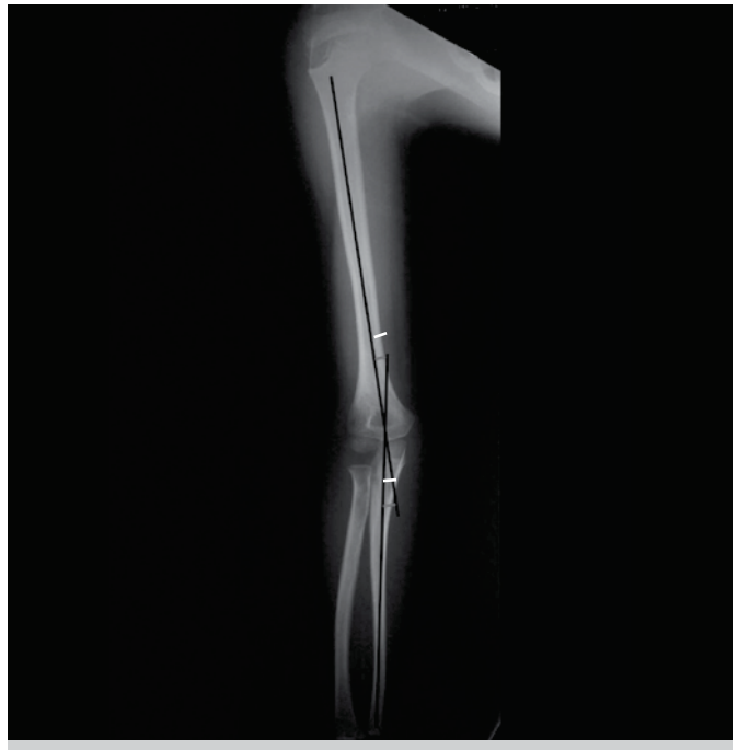
Figure 2. Computerized representation of the measurement of the elbow carrying angle by radiography.

For the statistical analysis of results a specialized professional from the area of medical statistics considered the nature of the distributions and the variables studied, applying the student's t-test. The level of rejection of the null hypothesis was set at 0.05 or 5% in all the tests, marking significant values with an asterisk (*).