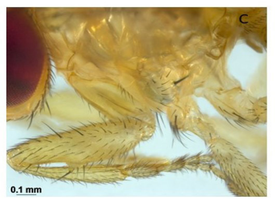
Figure 1. Dorsal view of adult Zaprionus tuberculatus (A); Lateral view of adult Zaprionus tuberculatus (B) and characteristic tubercle of the species on the first pair of legs (C).