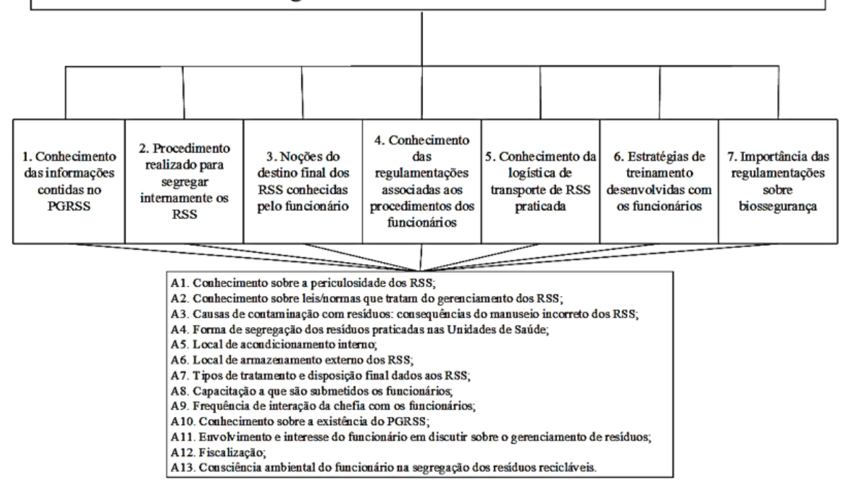
Figure 2 - Hierarchical structure decision.

Objetivo: Identificar indicadores de desempenho do processo de gerenciamento de RSS.