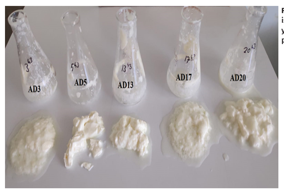
Figure 2. The bacterial isolates producing yogurt/yogurt-like product.