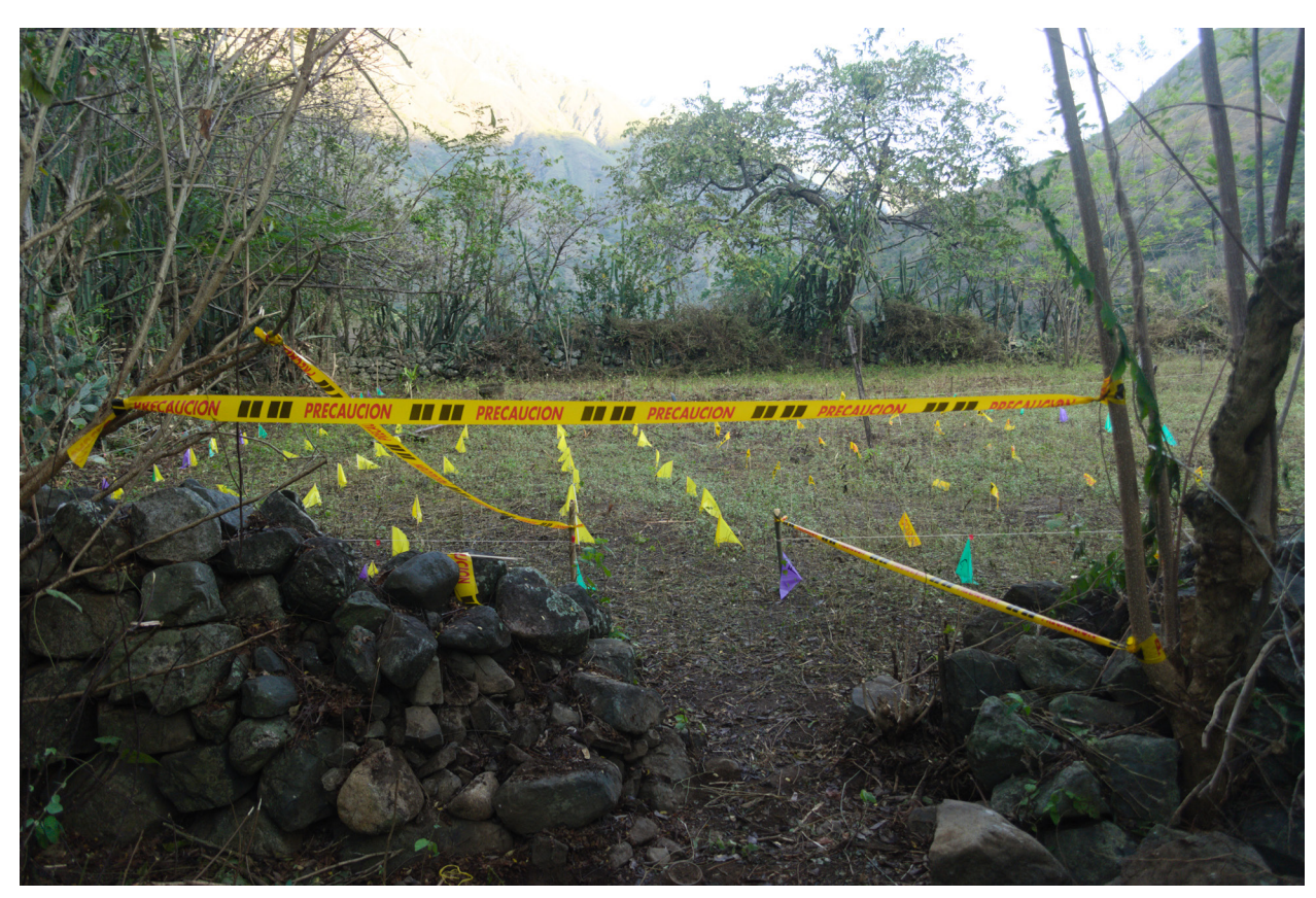
Figure 2. Photographs of the Barbacoas Cemetery with Flags Indicating Field Assessment Methods.

to remove the ground deposit from the coffin once in the laboratory. A single block could contain two or more individuals. Next, soil was cleaned from the bones in a dry process, and roots and clothing were removed. The bones were then cleaned with water and soft-bristle brushes or paintbrushes to finish removing the foreign material. All the items in the funeral trousseau that accompanied the skeletons were similarly cleaned. Afterwards, the human remains and associated materials were dried at room temperature in shadow to prevent their deterioration. Next, each bone found in the exhumation was labeled with ink. Finally, skeletons were laid out anatomically on the tables for photographic documentation (See Figure 4).