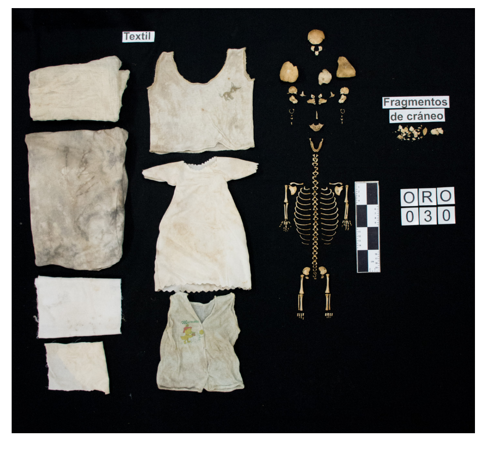
Figure 4. Photograph of the anatomical positioning of each bone in the skeleton of a biologically immature individual.

Figure 3. Photograph of the documentation model used for a tomb.