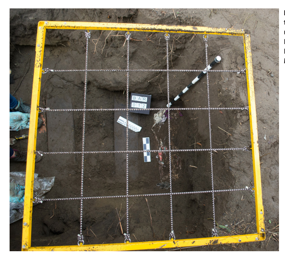
Figure 3. Photograph of the documentation model used for a tomb.