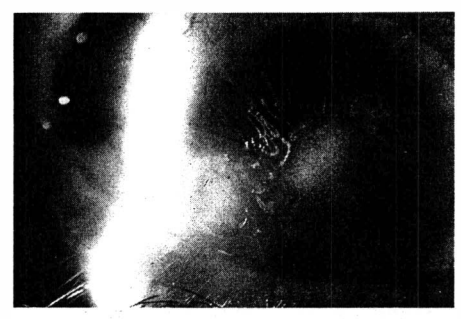
Figure 1 - Central corneal opacity with radiating folds at the level of Descemet's membrane, identifiable by the slit of the parallepiped. (Case 1).

ting folds of Descemet's membrane, in a caput medusae, were noted starting at the margins of the infiltrate. Her IOP which was initially 18 mmHg dropped to 5 mmHg (after the folds had appeared), the epithelial defect healed, but the folds persist.