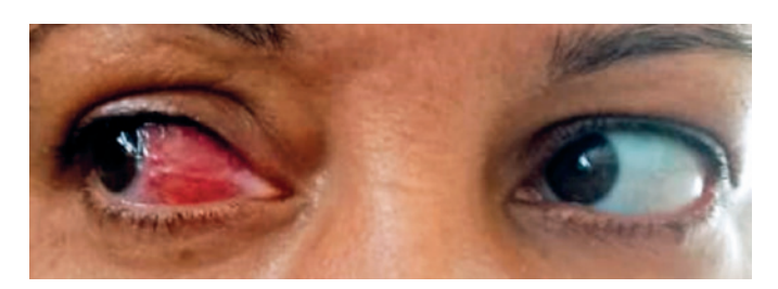
Figure 1. Image of both eyes showing nodular anterior scleritis in the nasal region of the right eye.

Laboratory tests revealed the following: a normal complete blood count, serum creatinine, blood urea