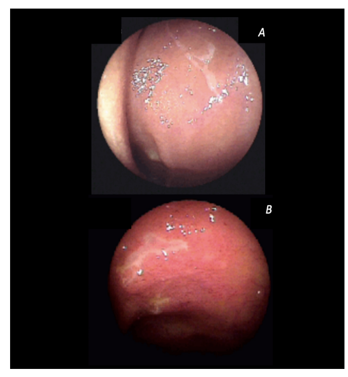
FIGURE 4. A) Case 19: Superficial ulcer covered by fibrin in the duodenum. B) Case 17: Presence of ulcers covered by fibrin in the ileum.

GIT symptoms prior to DBE were present in 36.8% of the patients and, after follow-up, all of them persisted with some of the symptoms (FIGURE 4). Bleeding was reported by 3/19 patients at baseline and persisted in only one patient.