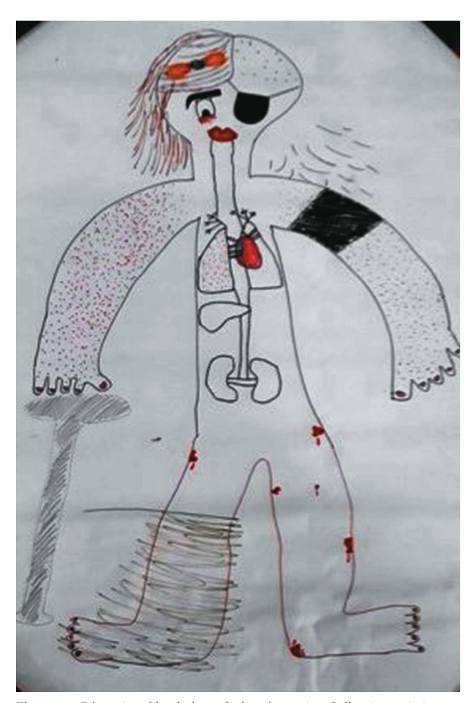
Figure 1 - Educational body-knowledge dynamics. Collective artistic production of adolescents-teachers

The effects of treatment materialized in the body's design to reflect what was seen (eye and left arm) and what was not seen (in the cardiovascular, nervous, genitourinary, hematological systems). In a dialogical movement and adopting accessible language to adolescent students' age and reality, knowledge was circulated horizontally, with artistic production mobilizing dialog and directing the construction of knowledge. The body as a metaphor provided an escape line to reflect on a theme without naming the adolescent in the reference case. The educational process problematized the metaphor of the designed body and mobilized semi-transitive awareness towards the naive transitive as a social construction; one about the changes in body image caused by becoming ill with cancer.