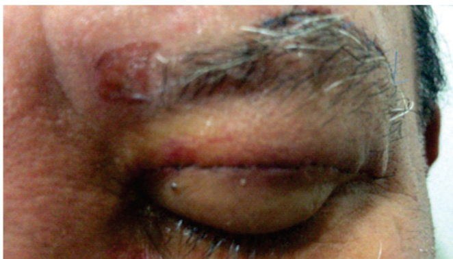
Figure 1: Three days after surgery.

The patient presented good recovery without major sequelae (photos).