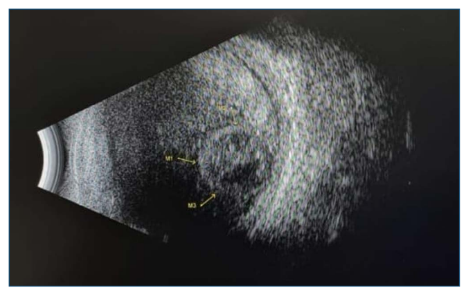
Figure 1. Ocular B-Scan ultrasonography showing a cystic lesion compatible with ocular cysticercosis.

In view of these findings, a medical meeting was held with retina and oncological Ophthalmology Services,