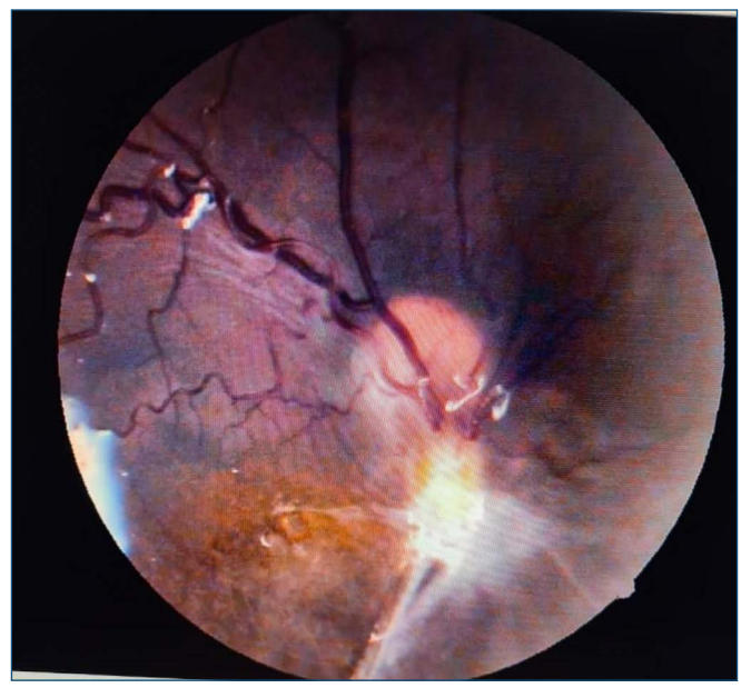
Figure 3. Postoperative fundus photo showing fibrotic tissue that is directed towards inferior and temporal retina without traction.

evaluated the patient, and it was considered that there was no requirement of surgical management of exotropia secondary to neurosensory deprivation.