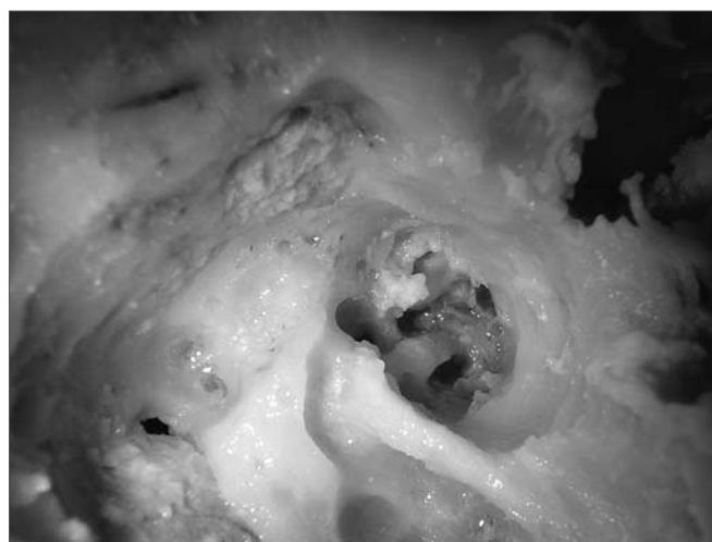
Figure 1. Superior and inferior tunnels, joining the cochleostomy to the internal carotid artery.

process, and at 2mm anteriorly to the cochlea's middle turn. After the cochleostomy, we drilled a communication (Tunnel) between them and the internal carotid artery. The burr used had the same thickness of the graded measuring device, so that it could fit precisely in order to carry out the measurings. The upper portion of the cochlea was removed, so that we could see the measuring device going through the cochlear turns from the cochleostomy and reaching the internal carotid artery (Figure 1). This procedure does not alter the values of the measures. The measuring was carried out from the inferior border of the cochleostomy entrance, all the way to the greater posterior projection of the internal carotid artery (Figure 2).