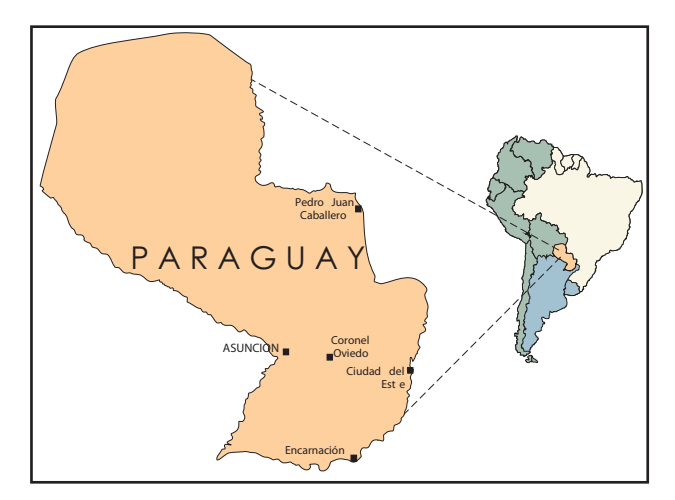
Figure 1 - Map of Paraguay showing the cities where this study was performed.

Volunteer female commercial sex workers and men who have sex with men in the cities of Asuncion, Ciudad del Este, Encarnacion, PJ Caballero and Coronel Oviedo, aged 18 years or older, were invited to participate (Figure 1). Female commercial sex workers who reported sexual relations with at least one man in the preceding six months were enrolled. In addition, previously diagnosed HIV-positive patients identified at PRONASIDA in Asuncion were eligible to participate for the purposes of viral genotyping.