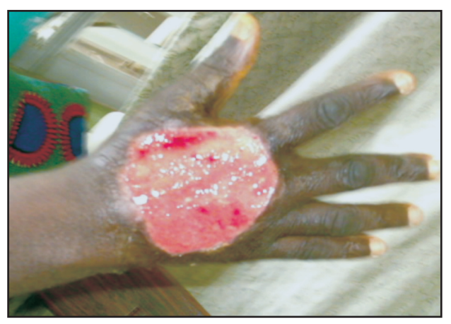
Figure 3 - Right band ulcer.