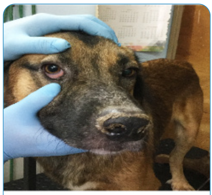
FIGURE 1: Canis familiaris specimen with dermal injuries and ulcers typical of leishmaniasis.

disease were observed and registered by professional veterinarians from CAN and the details are presented in Table 1 and Figure 1 .