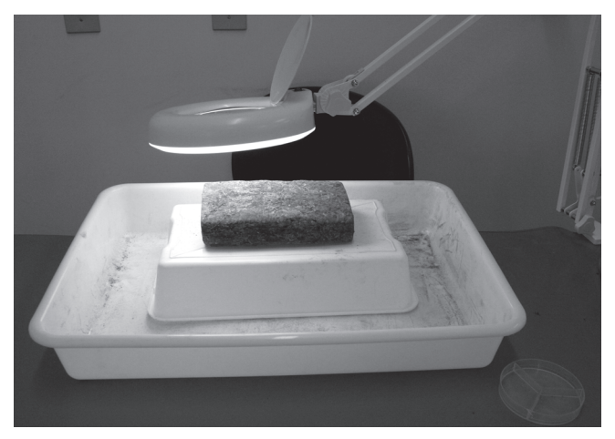
Fig. 1. Screening for insects in the cannabis plant material, showing the drug above the pedestal inside the screen collector under a 5x magnifying glass with artificial lighting.

the aid of a stereoscopic microscope. Animal or other plant material removed from C. sativa block was isolated, photographed, registered, and received a reference number, being stored in individual microtubes. Insect samples that were considered identifiable were sent to expert taxonomists for species determination. All the fragments of insects found in the cannabis' survey were preserved as voucher material and deposited in the entomological collection of the Universidade de Brasília .