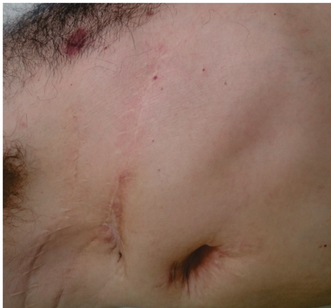
Figure 3. Anterolateral aspect of the patient's right chest, 22 months after the end of NPT, with healed wounds.

risks. There are reports of life-threatening complications such as right ventricular or aortic rupture 8 . In our patient, the lung and chest wall architectures were already changed, with fibrosis and retractions resulting from the numerous performed procedures. The application of NPT did not bring any harm to the patient.