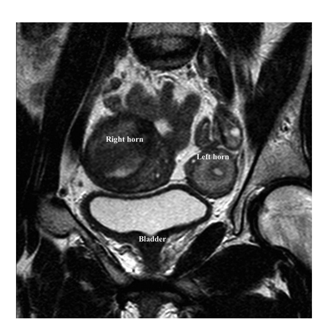
Fig. 4 An MRI scan, coronal plan weighted in T2 spin echo, showing double uterine fundus and the body of the uterus. The right side enlarged component presents heterogeneous contents.

Pregnancy in a rudimentary uterine horn is rare and often presents poor outcomes. The incidence of pregnancy in a