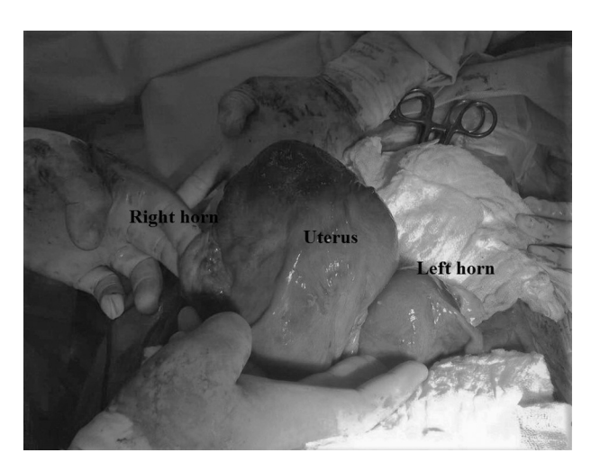
Fig. 2 An intraoperative indication of a bicornuate uterus with pregnancy development in the horn that does not communicate with the vagina.

At the postpartum follow-up, the patient had a good recovery, and at the 13th day after the cesarean section she was submitted to a transvaginal ultrasound. The ultrasonography image suggested two possible diagnoses: a unicornuate uterus with a non-communicating rudimentary horn or a bicornuate uterus. A magnetic resonance imaging (MRI) scan was necessary to clarify the diagnosis. The MRI description