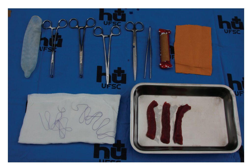
Fig. 1 Material used for simulator assembly and simulated laceration repair - Chocolate bar, condom, 15 cm imes 10 cm cotton cloth flap, beef strips \sim 1 cm \times 1 cm \times 8 cm, surgical material (tweezers, needle holder, scissors, Allis clamp) and suture.

cotton cloth flap; beef strips of \sim 1 cm \times 1 cm \times 8 cm; surgical material (tweezers, needle holder, scissors, Allis clamp) and suture (>Fig. 1). The beef was fat-free and had the longest fibers running longitudinally to simulate the sphincter fibers.