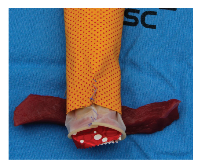
Fig. 3 Representation of the rectal mucosa and the internal anal sphincter sutured with a simple continuous suture.