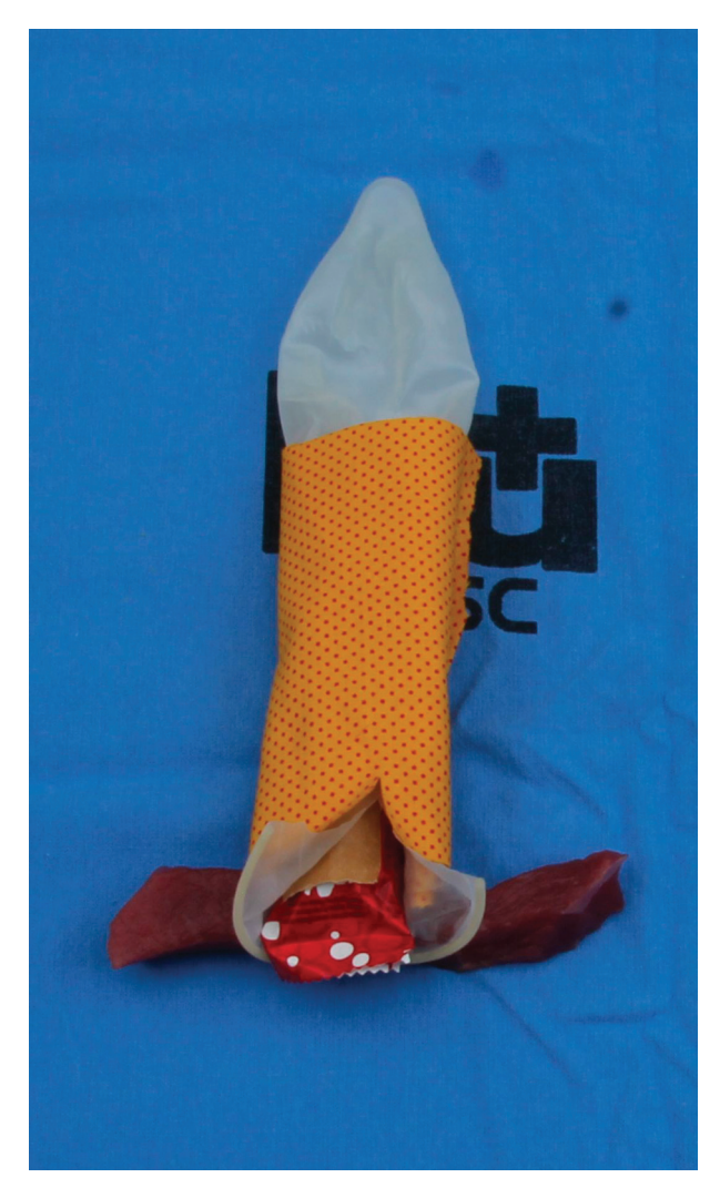
Fig. 2 Representation of the severe perineal laceration in the simulator.

The practical aspects of diagnosing and suturing severe lacerations include the need to evaluate the sphincter and the rectal mucosa after the delivery, adequate anesthesia, positioning of the patient, illumination, a good surgical field, and antisepsis.<sup>23–25</sup> The most appropriate wires for each anatomical layer were presented. The torn anal mucosa is repaired using a continuous (nonlocking) 3-0 or 4-0 braided polyglactin on a tapered needle; a monofilament suture such as poliglecaprone 25 is also acceptable. The internal anal sphincter should be properly identified and repaired as a separate layer (►Fig. 3) using a continuous 3-0 polyglactin suture or a 3-0 monofilament synthetic suture (for example, poliglecaprone 25) on a tapered needle. 24,25 The external anal sphincter was sutured with end-to-end techniques or overlapping plication (Fig. 4) using interrupted or figureof-eight sutures; 2-0 or 3-0 polydioxanone or 2-0 polyglactin suture on a tapered needle. <sup>24,25</sup> In the simulation, to reduce costs, yarns that were past due or cheaper, such as catgut, were used.