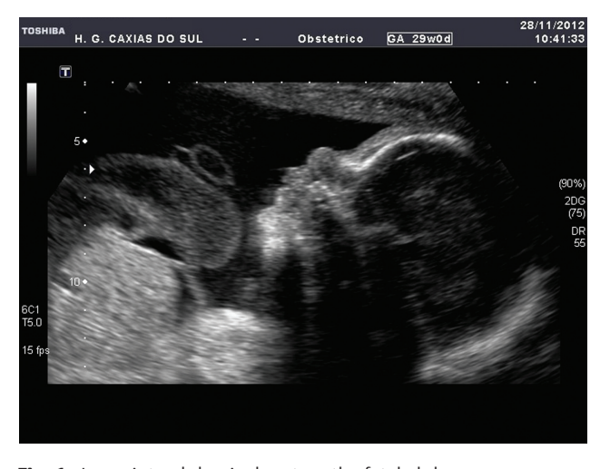
Fig. 1 Large intraabdominal cyst on the fetal abdomen on sonographic examination.

various intracardiac congenital abnormalities. The literature regarding this topic has presented few patients with the full spectrum of the pentalogy.<sup>1-6</sup> We report the case of a newborn who, in the 2<sup>nd</sup> trimester of pregnancy, with the aid of 2D combined with 3D ultrasound (US) (>Fig. 1), fetal echocardiography and magnetic resonance imaging (MRI) (Figs. 2 and 3), had a confirmed diagnosis of a large omphalocele, as well as of evisceration of part of the fetal liver, of the intestine, of the apex of the heart, and a defect in the interventricular septum and in the interatrial septum, along with a diaphragmatic hernia and a poor closing of the sternum. Surgical correction of the omphalocele was attempted with myocutaneous flaps. However, as a result of a progressive respiratory dysfunction, neonatal death occurred on the 32<sup>nd</sup> day of life. The authorization of the family to perform an autopsy examination was not obtained. The present research was conducted