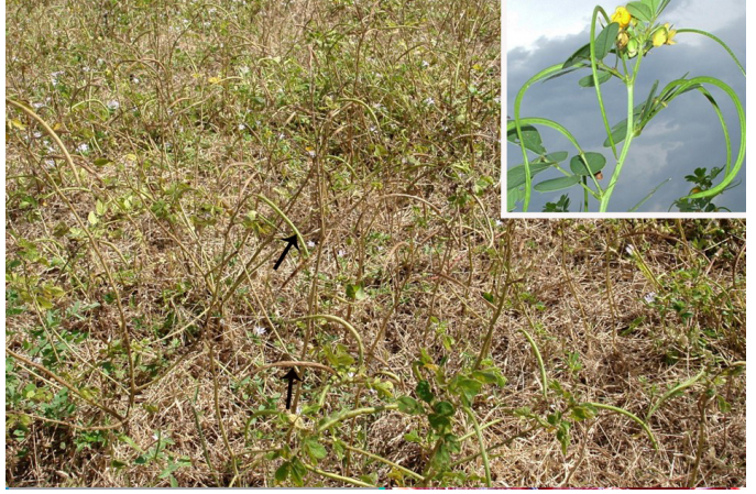
Fig.1. Pasture severely invaded by Senna obtusifolia with numerous pods (arrows). Inset: Flowers, pods and leaves of S. obtusifolia .

No clinical signs were observed in the 15 goats grazing at the same time with the affected sheep flock.