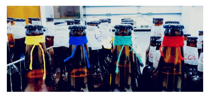
Figure 1 . Bottles provided to the consumers, being the only difference, among these, the colors of the decorative twines on the bottle-neck. Yellow twine bottle contains the control protocol beer, while blue, green and red twine contains the beers made using PAY15, PAY30 and PAY45 protocols, respectively.

Total reducing sugar ([TRS], g.L<sup>-1</sup>) was evaluated using DNS method, as previous described by Magalhães et al. (2018). Total soluble protein ([TSP], g.L<sup>-1</sup>) was evaluated using Biuret method,