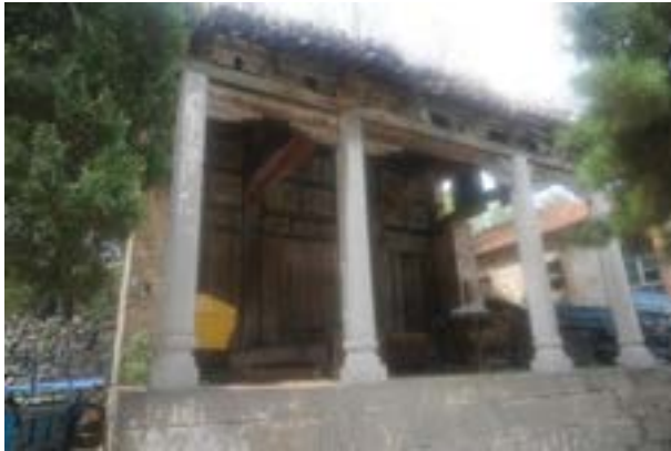
Figure 3 -Ancient theater of official house in East Ma’an Village, Heshun Town

Photographed by the author Hengli Peng, on July 22, 2019)