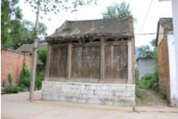
Figure 2 - Ancient Theater of Official House in Yanghe Village, Wulong Town

Photographed by the author Hengli Peng, on July 22, 2019