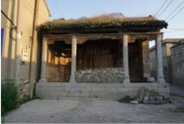
Figure 1 - Ancient Theater of Official House in Jiaoling Village, Tongye Town

Photographed by the author Hengli Peng, on August 15, 2019.