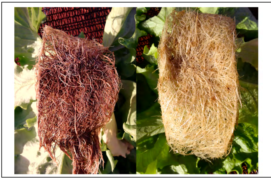
Figure 3 . Lettuce root system showing signs of stress caused by low oxygenation (left), related to a nutrient solution at 4.0 L/min flow rate and well-developed root system with adequate oxygen supply (right), nutrient solution at 1.0 L/min flow rate. Aparecida do Taboado, UNESP, 2017.

mass production than the other rates in experiments carried out in Parana (Santos et al. , 2011) and Rio de Janeiro (Genuncio et al. , 2012). We highlight that temperature, relative humidity and more intense solar radiation where the experiment was conducted also contribute for water stress, causing even more damage to the plants grown at this flow rate.