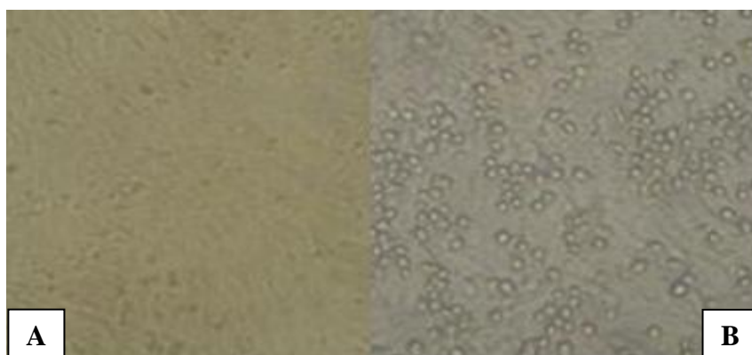
Figure 2. MDCK control cells (A) and cytopathic changes (B) observed at 3 days post infection over MDCK cells inoculated with liquid of skin lesions of a four-year-old female Labrador Retriever. (Obj. 10X and 20X, respectively).