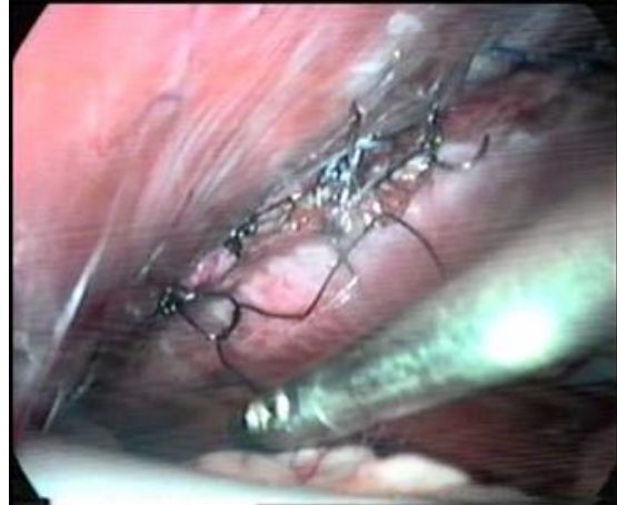
Figure 2. Left Paracostal hernia in an eight-month-old dog. Videolaparoscopic image shows intracorporeal suturing of the thoracoabdominal defect.