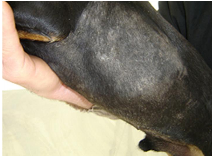
Figure 3. Eight-month-old dog, submitted to videolaparoscopy for treatment of a left paracostal hernia. Eight days after surgical procedure, small scars can be seen in the left abdominal wall where the trocars were inserted (arrows).

Given that the alterations present in the hernias are anatomical, the treatment is only accomplished by surgical reconstruction of the disrupted musculature (Smeak, 2007). The most common surgical approach for traumatic abdominal herniorrhaphy is middle line laparotomy or laparoscopy (Brun et al. ,