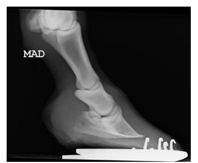
Figure 2. Lateromedial radiograph of a hoof, in which a loss of the phalanx axis and a bone remodeling of the third phalanx can be seen.

To confirm the diagnosis, the combined insulin and glucose test was performed, with 24 hours on an empty stomach before the test took place and, later, a jugular intravenous catheter was introduced (14G) in order to administer 150mg/kg of dextrose at 50% and, immediately, 0,10\mu/kg of crystalline insulin (minute 0).