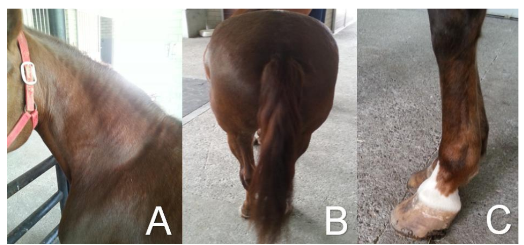
Figure 1. Obesity and chronic laminitis in a SME case. A, located adiposity; B, adiposity in the gluteal region and the perineum; C, concentric rings in hooves.