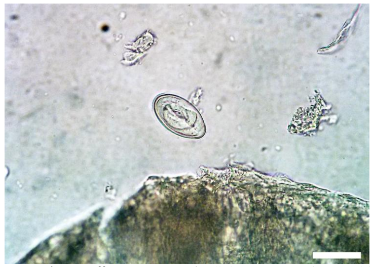
Figure 3. Gongylonema sp. in a Geoffroy's marmoset ( Callithrix geoffroyi ) from Espirito Santo, Brazil. Embryonated egg observed at lingual scrapping. Scale bar= 50 µm.

was evaluated by light microscopy for the presence of adult parasites and eggs. There were no adult parasites in this preparation, but a small number of small, thick-shelled, oval, embryonated eggs were observed (Figure 3).