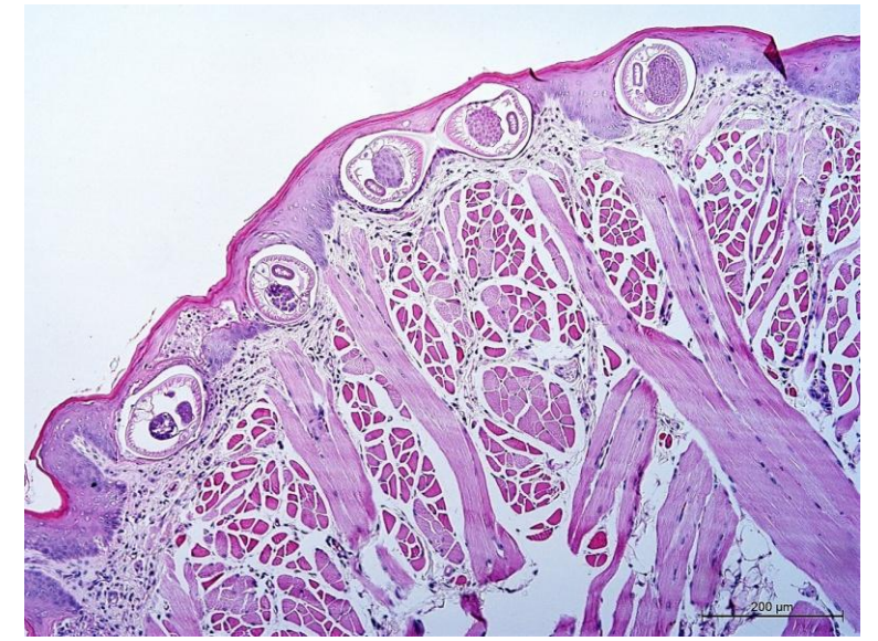
Figure 1. Gongylonema sp. in the tongue of a free-ranging Geoffroy's marmoset ( Callithrix geoffroyi ) from Espírito Santo, Brazil. Tongue with five cross sections of spirurid parasite within the epithelial layer of the mucosa, compatible with a serpentine path, HE, 100x, scale bar= 200 \mu m .

Morphologically, the nematode had a thick cuticle with winged lateral alae, coelomyarian musculature, a small intestine composed of columnar cells, prominent lateral cords, free eosinophilic fluid in the pseudocoelom, and one large testis (Figure 2).