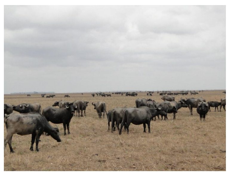
Figure 4. Buffaloes belonging to several owners and raised in a huge extensive area, which makes mineral supplementation difficult. Cachoeira do Arari, Marajó Island, PA.

Given these difficulties, alternatives must be found in an attempt to mitigate the economic losses related to mineral deficiencies, especially copper. This pioneering study, using injectable copper in buffaloes, on Marajó Island, proved to be efficient in correcting the deficiency status, both by the deposition of copper in the liver and by the elimination of clinical signs that the buffalo calves had before receiving parenteral copper.