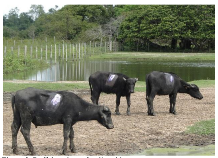
Figure 2. Buffalo calves after liver biopsy surgery.

oxytetracycline (1mL per 10kg of BW - IM), flunixin meglumine (2mg per kg of BW, IM). Once a day, the closed wound was sprayed with a spray solution mixture containing silver sulfadiazine (0.1g), aluminum (5.0g) and cypermethrin (0.4g) per 100g (Figure 2).