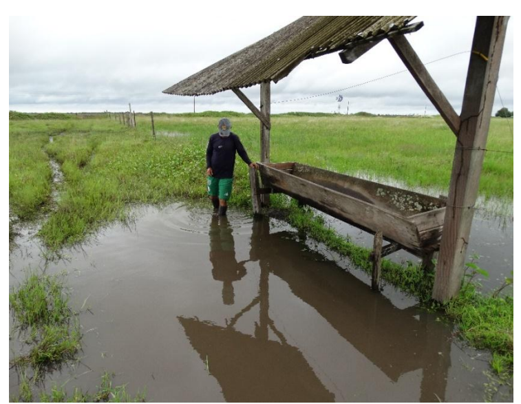
Figure 5. Trough for mineral supplementation in a flooded area, which makes it particularly difficult to supply the mineral mixture. Cachoeira do Arari, Marajó Island, PA.