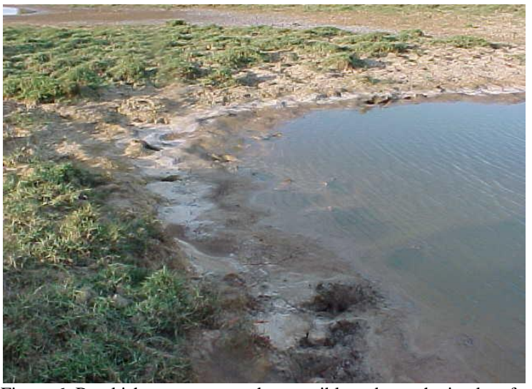
Figure 6. Brackish water source that possibly reduces the intake of mineral mixtures. Note the deposit of salts on the water's edge. Cachoeira do Arari, Marajó Island, PA.