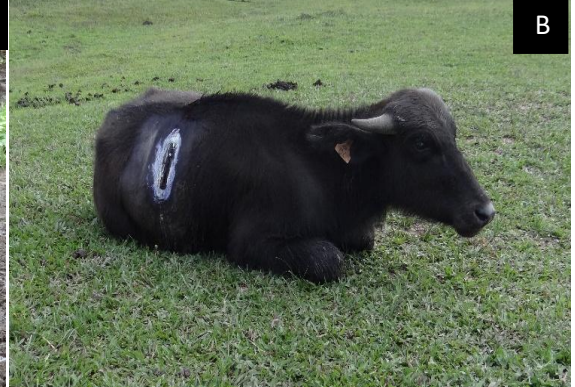
Figure 3. A - Buffalo 1 (Group 1) before liver biopsy and administration of the first dose of 120 mg of copper, showing a rough reddish hair pigmentation. B - Same animal in the 2<sup>nd</sup> biopsy, showing better body condition score and normal hair color.

In the second biopsy, performed after 135 days, the average copper content in the animals in group 1 was 311.2mg/kg of hepatic DM, quite above the 100mg/kg DM, which are considered indicators of non-copper deficient animals (Underwood, 1977; Table 1). Animals from group 2 which did not receive parenteral copper, values remained low (9.11mg/kg DM) and typical of animals clinically deficient in copper (Table 1).