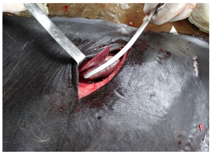
Figure 1. Caudal edge of the caudate lobe of the liver, clamped at the time of the biopsy with a Doyan model atraumatic forceps.

11<sup>th</sup> intercostal space, followed by blunt dissection of the subcutaneous and muscle tissue, to expose the caudal edge of the caudate lobe of the liver. Then, a Doyan atraumatic forceps was used to pull the caudal edge and at the same time to perform hemostasis after the cut and removal of approximately 5 grams of liver sample (Figure 1).